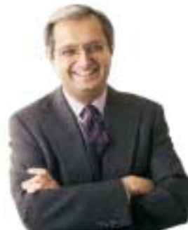
Vikram S. Pandit Co-President and Chief Operating Officer Morgan Stanley