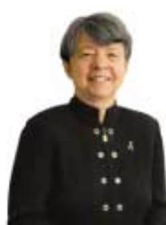
Mary Jo White Partner Debevoise & Plimpton