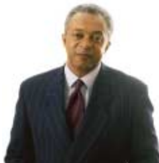
E. Stanley O'Neal President and Chief Operating Officer Merrill Lynch & Co., Inc.