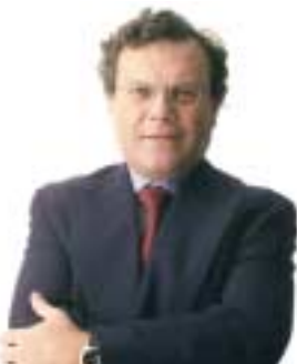
Martin S. Sorrell Group Chief Executive and Director WPP Group USA, Inc.